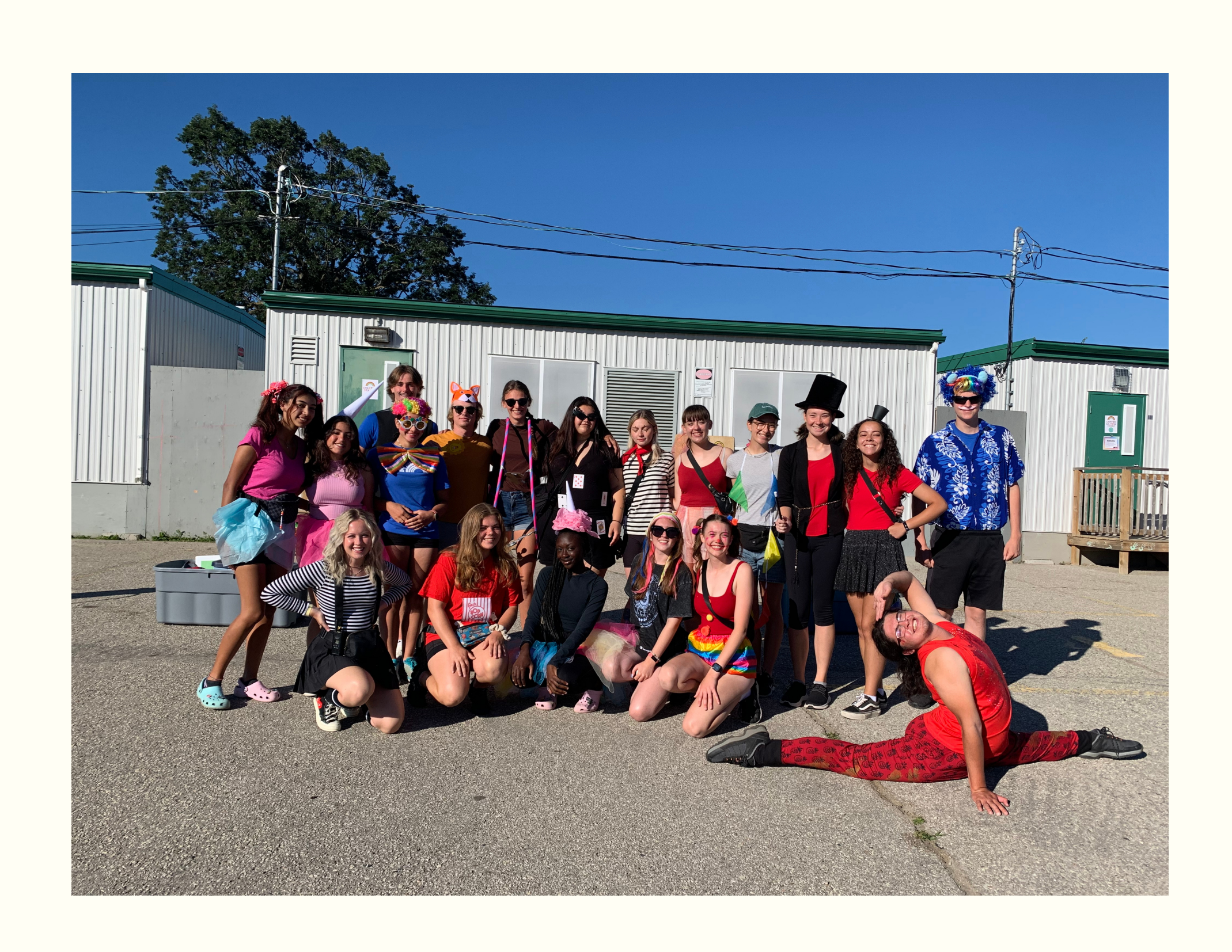
Sponsorship Package 2024